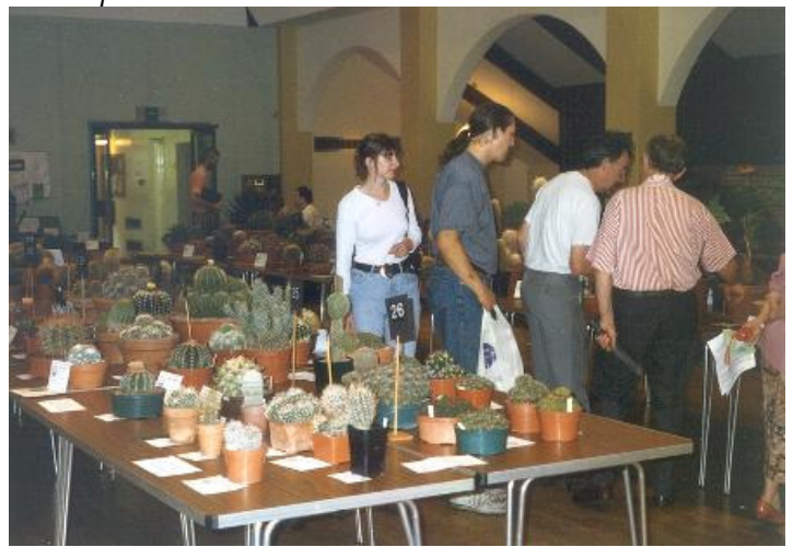
The Open Classes attract interest