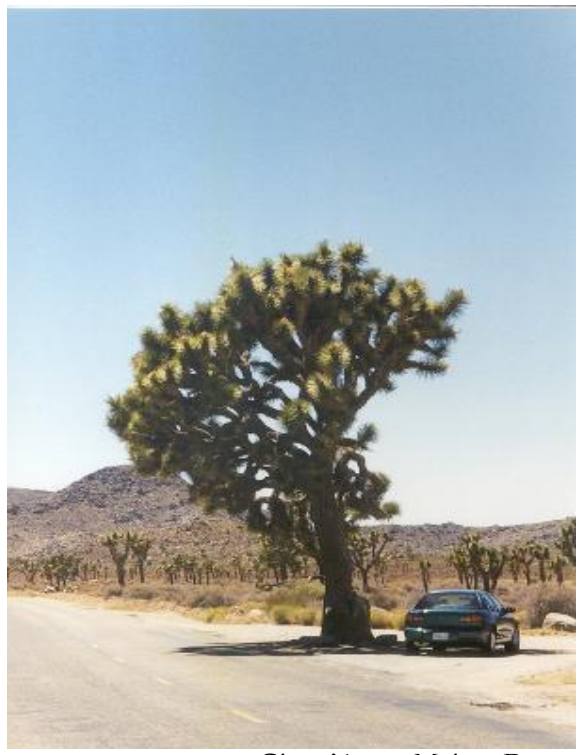
Giant Yucca, Mojave Desert

A two-week touring vacation by car, prior to the '97 CSSA Convention, gave us the opportunity to see some fat plants in the wild. We flew into San Diego - staying just one night - and set off to Palm Springs via the Anza-Borrego national park. The latter is a famed place for cacti and agaves, but by inadvertently going on the less-interesting road through, and because we had to make good time on a long day's drive, we hardly got to grips with it. There was one interesting gorge on the way in, lined with red-spined Ferocactus acanthodes, but otherwise we crossed a dead flat plain of low, jointed-stemmed Opuntia bushes (cholla), creosote bushes and other desert flora.