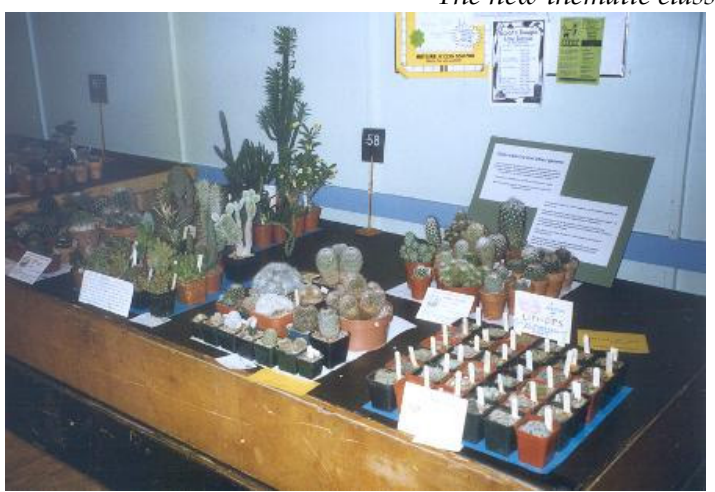
The new thematic class